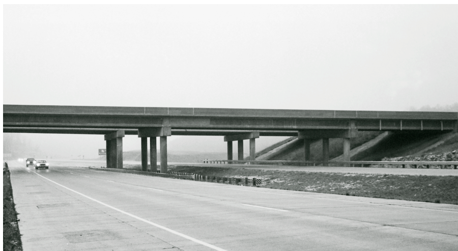
The use of high strength concrete allowed wider girder spacing.

Chojnacki, T. M., "Determination of High Performance Concrete (HPC) Characteristics," MoDOT RDT Report No. RDT99-008, September, 1999. For a copy of the report or for further information, contact the author at 573-526-4337 or chojnt@mail.modot.state.mo.us