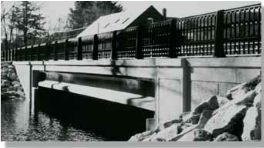
The use of HPC allowed for a wider girder spacing and more durable structure.