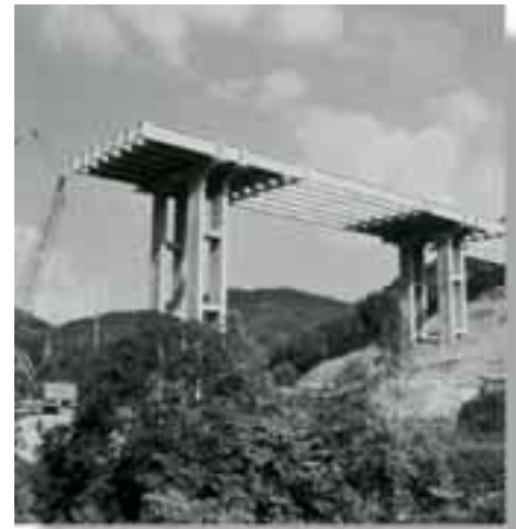
Lightweight concrete was used on the Shelby Creek Bridge to reduce superstructure weight.

The use of lightweight aggregates, while more expensive than conventional aggregates, does not increase the total project cost. Consider the use of lightweight HPC on an 8-in. (200-mm) thick concrete bridge slab with a cost premium of $30/cu yd ($39/cu m). One cubic yard (0.76 cu m) of concrete will yield approximately 40 sq ft (3.7 sq m) of deck causing an increase in slab cost of 30/40 = \$0.75/\text{sq ft} ($8.07/sq m). For a bridge with a total cost of $75/sq ft ($807/sq m) this results in a cost increase of one percent. However, this one percent material cost is offset by the reductions in the cost of slab reinforcement and the reduced size and cost of girders, piers, and foundations all due to a lower superstructure self weight of approximately 20 percent.