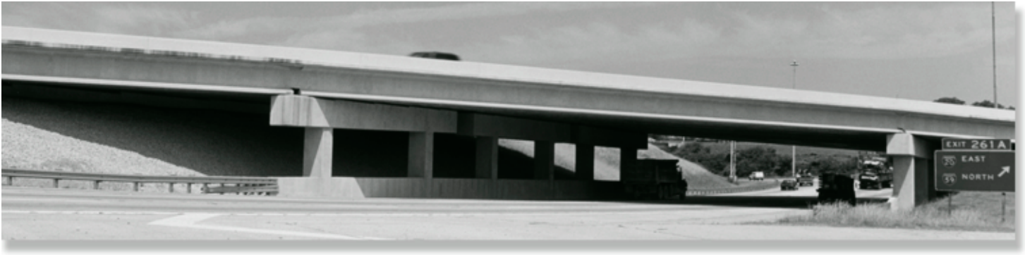
High strength precast, prestressed concrete girders were selected for fast construction.

Fred Conway, Alabama Department of Transportation