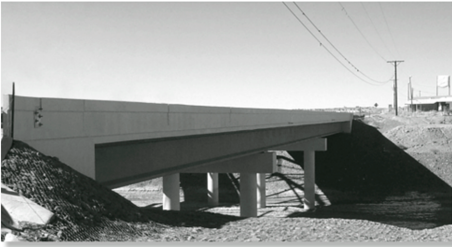
The viability of using HPC in New Mexico was established with construction of the Rio Puerco Bridge.