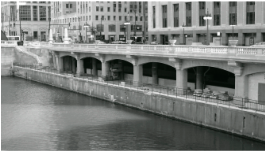
High performance concrete was used to provide a minimum service life of 75 years.

by additional mixing, or by stopping the truck's drum completely for a time. However, the HPC on this project seemed reluctant to release entrained air regardless of these, or any other techniques. It was believed that the four cementitious materials made for a very sticky mix and the entrained air was unable to escape from the cementitious materials. This problem persisted throughout the project, and was the primary cause of rejected concrete.