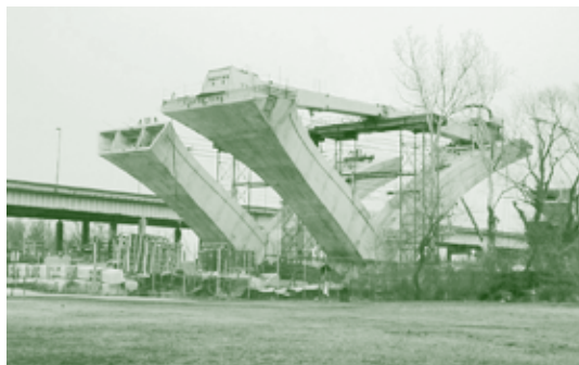
The V-piers and tie beams used HPC.

Based on the above requirements and using Fick's Second Law of Diffusion applied to the uncracked concrete, it will require an estimated 60 years for chloride ingress to initiate corrosion activity at the level of the reinforcing steel assuming that corrosion begins at a chloride concentration of 2.0 lb/cu yd (1.2 kg/cu m). An additional 20 years from the start of corrosion of the top reinforcing steel until corrosion damage occurs will provide a service life in excess of the required 75 years.*